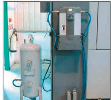
A Regenerative Desiccant Dryer System Installed to Supply Control Air for a CNC Machining Center.